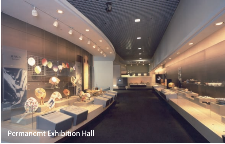
Permanent Exhibition Hall